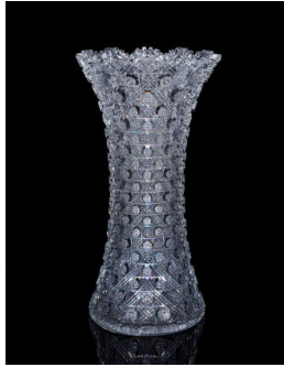
Title: Vase Date: c. 1900 Primary Maker: T.G. Hawkes & Company Medium: cut glass