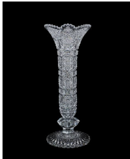
Title: Vase Date: 1880-1917 Primary Maker: T.G. Hawkes & Company Medium: cut glass