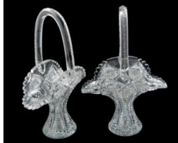
Title: Basket Primary Maker: T.G. Hawkes & Company Medium: cut glass