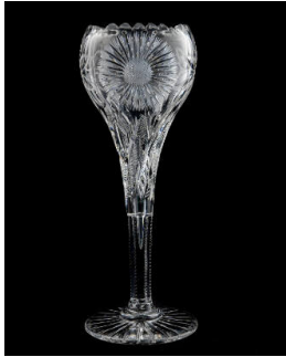
Title: Vase Date: c. 1900 Medium: cut glass