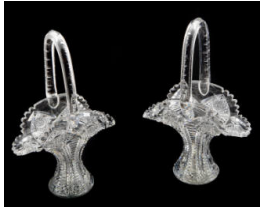
Title: Basket Primary Maker: T.G. Hawkes & Company Medium: cut glass