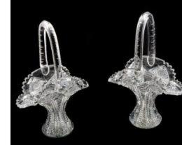
Title: Basket Primary Maker: T.G. Hawkes & Company Medium: cut glass