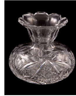
Title: Vase Medium: cut glass