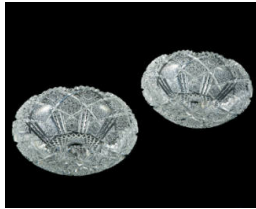
Title: Bowl Date: c. 1900 Primary Maker: Pairpoint Manufacturing Company Medium: cut glass