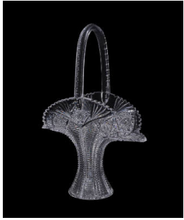
Title: Basket Primary Maker: T.G. Hawkes & Company Medium: cut glass