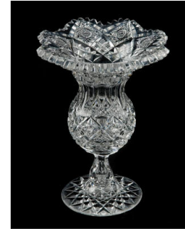
Title: Vase Date: c. 1900 Primary Maker: T.G. Hawkes & Company Medium: cut glass