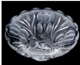
Title: Fruit Bowl Date: after 1903 Primary Maker: T.G. Hawkes & Company Medium: cut glass