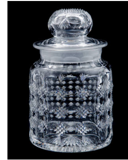
Title: Cigar Humidor Primary Maker: Pairpoint Manufacturing Company Medium: cut glass