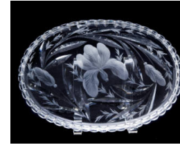
Title: Tray Date: after 1903 Primary Maker: T.G. Hawkes & Company Medium: cut glass