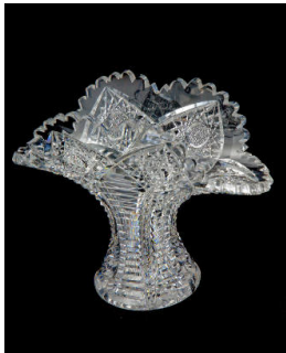
Title: Fan Vase Date: 1880-1917 Primary Maker: T.G. Hawkes & Company Medium: cut glass