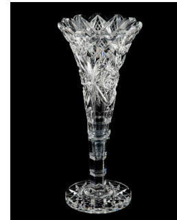
Title: Vase Date: c. 1900 Primary Maker: T.G. Hawkes & Company Medium: cut glass