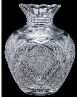
Title: Vase Date: c. 1900 Medium: cut glass