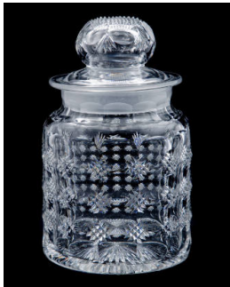
Title: Cigar Humidor Lid Primary Maker: Pairpoint Manufacturing Company Medium: cut glass