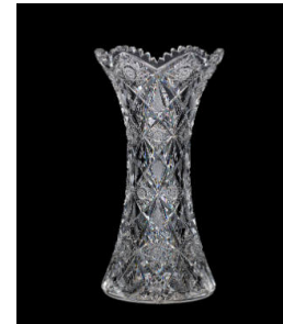
Title: Vase Date: c. 1900 Primary Maker: T.G. Hawkes & Company Medium: cut glass