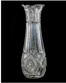
Title: Vase Date: c. 1900 Primary Maker: J. Hoare & Company Medium: cut glass