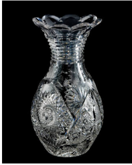
Title: Vase Date: c. 1900 Primary Maker: Unknown American Medium: cut glass