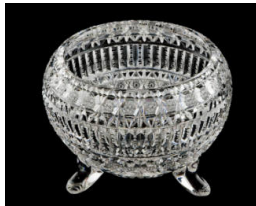
Title: Ferner Date: c. 1900 Primary Maker: T.G. Hawkes & Company Medium: cut glass