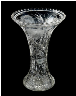
Title: Vase Date: after 1903 Primary Maker: T.G. Hawkes & Company Medium: cut glass