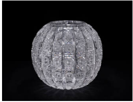
Title: Rose Bowl Date: c. 1909 - 1918 Primary Maker: T.G. Hawkes & Company Medium: cut glass