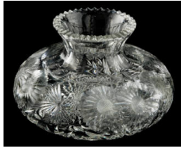
Title: Vase Date: c. 1900 Primary Maker: Pairpoint Manufacturing Company Medium: cut glass