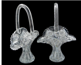
Title: Basket Primary Maker: T.G. Hawkes & Company Medium: cut glass