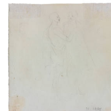
Title: Sketch of two Indians Date: 1837 Primary Maker: Alfred Jacob Miller Medium: pencil on paper