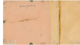
Title: Sketch of profile of man's face Date: 1837 Primary Maker: Alfred Jacob Miller Medium: pencil on paper