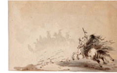
Title: Clouds of Dust Date: 1837 Primary Maker: Alfred Jacob Miller Medium: pen and ink, ink wash, with pencil and gouache on paper