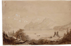
Title: Indian Encampment, Wind River Mountains Date: 1837 Primary Maker: Alfred Jacob Miller Medium: pencil and gouache on paper