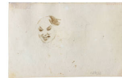
Title: Head of a man and sketch of house Date: 1837 Primary Maker: Alfred Jacob Miller Medium: ink and pencil on paper