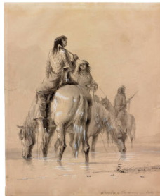
Title: Females, Shoshone, Rocky Mountains