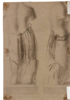
Title: Sketch of antique sculpture of figure Date: 1837 Primary Maker: Alfred Jacob Miller Medium: charcoal on paper