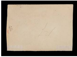
Title: Sketch of two indian faces