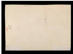
Title: Sketch of earring