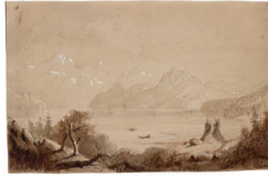
Title: Indian Encampment, Wind River Mountains Date: 1837 Primary Maker: Alfred Jacob Miller Medium: pencil and gouache on paper