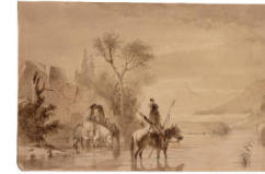
Title: Indians Watering their Horses