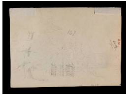
Title: Sketch of cabin and tree