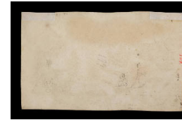
Title: Sketch of wigwam with bear design and seated man with hat and standing male