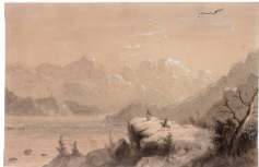
Title: Lake Scene, Wind River Mountains