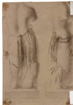
Title: Sketch of antique sculpture of figure Date: 1837 Primary Maker: Alfred Jacob Miller Medium: charcoal on paper