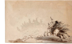
Title: Clouds of Dust Date: 1837 Primary Maker: Alfred Jacob Miller Medium: pen and ink, ink wash, with pencil and gouache on paper