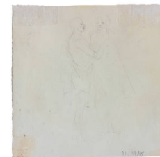
Title: Sketch of two Indians Date: 1837 Primary Maker: Alfred Jacob Miller Medium: pencil on paper