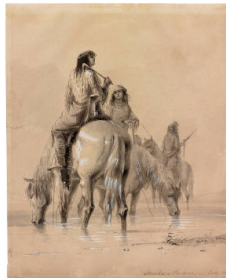
Title: Females, Shoshone, Rocky Mountains