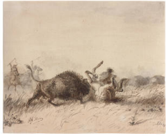
Title: Striking Back, Coming to the Rescue Date: 1837 or after Primary Maker: Alfred Jacob Miller Medium: pen and ink and wash on paper