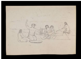
Title: Study of Group in Lodge Interior