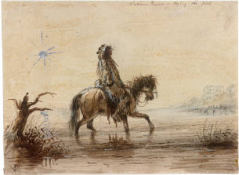
Title: Indian Guide, Trying the Ford Date: 1837 Primary Maker: Alfred Jacob Miller Medium: pen and ink, ink wash with white highlights on paper