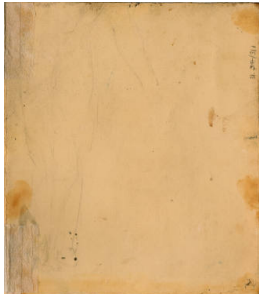
Title: Sketch of partial human body Date: 1837 Primary Maker: Alfred Jacob Miller Medium: pencil on paper