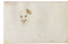
Title: Head of a man and sketch of house Date: 1837 Primary Maker: Alfred Jacob Miller Medium: ink and pencil on paper