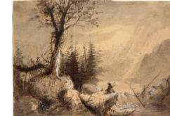
Title: Lake in Oregon

Medium: pencil and black wash with white highlights on beige paper