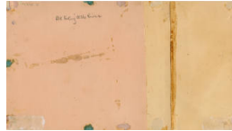
Title: Sketch of profile of man's face Date: 1837 Primary Maker: Alfred Jacob Miller Medium: pencil on paper