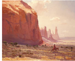
Title: Monument Valley Date: c. 1952 Primary Maker: Fremont F. Ellis Medium: oil on paper mounted on paperboard