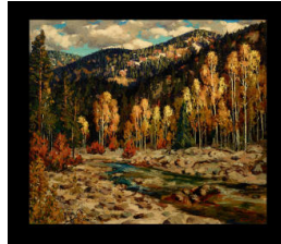
Title: The Trout Stream Date: 1925 Primary Maker: Fremont F. Ellis Medium: oil on canvas