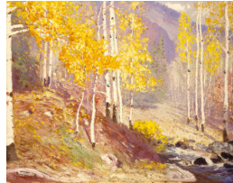
Title: Silver and Gold Date: c. 1957 Primary Maker: Fremont F. Ellis Medium: oil on paper mounted on paperboard