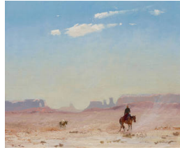
Title: Blowing Sand Primary Maker: Fremont F. Ellis Medium: oil on canvas board