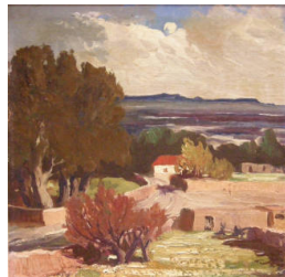
Title: Old Galisteo Primary Maker: Fremont F. Ellis Medium: oil on canvas board