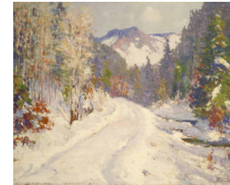
Title: Winter, Cumbres Pass Date: c. 1953 Primary Maker: Fremont F. Ellis Medium: oil on canvas