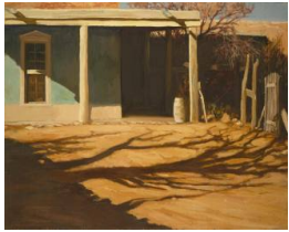
Title: The Blue Portal Date: 1952 Primary Maker: Fremont F. Ellis Medium: oil on canvas