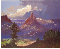
Title: Navajo Canyon Primary Maker: Fremont F. Ellis Medium: oil on canvas