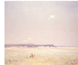
Title: The Silent Desert Primary Maker: Fremont F. Ellis Medium: oil on hardboard