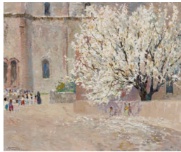
Title: The Almond Tree Date: c. 1950 Primary Maker: Fremont F. Ellis Medium: oil on hardboard