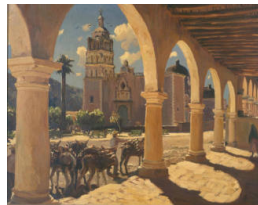
Title: The Arches of Alamos Mexico Primary Maker: Fremont F. Ellis Medium: oil on canvas