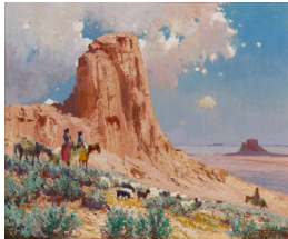
Title: The Red Rock Date: c. 1957 Primary Maker: Fremont F. Ellis Medium: oil on canvas board