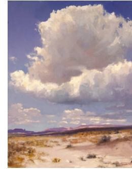
Title: Summer Clouds, New Mexico Date: c. 1953 Primary Maker: Fremont F. Ellis Medium: oil on canvas