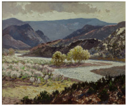
Title: The Shining River Primary Maker: Fremont F. Ellis Medium: oil on hardboard