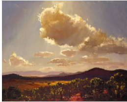
Title: Pinon Country Date: 1953 Primary Maker: Fremont F. Ellis Medium: oil on canvas