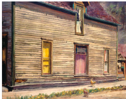
Title: The Clapboard House Date: 1925 Primary Maker: Fremont F. Ellis Medium: oil on panel