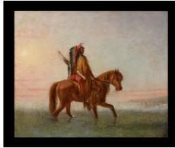
Title: Indian Guide Trying the Ford Date: c. 1840 Primary Maker: Alfred Jacob Miller Medium: oil on canvas