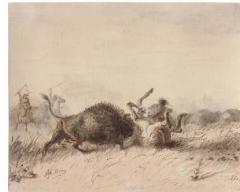
Title: Striking Back, Coming to the Rescue Date: 1837 or after Primary Maker: Alfred Jacob Miller Medium: pen and ink and wash on paper