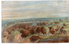
Title: Buffalo Hunting Date: c. 1837 Primary Maker: Alfred Jacob Miller Medium: watercolor with pen and ink on paper