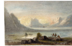
Title: Sunset, Wind River Mountains Date: 1837 Primary Maker: Alfred Jacob Miller Medium: watercolor and pencil on paper