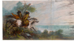
Title: Indians Pursuing an Elk Date: 1837 Primary Maker: Alfred Jacob Miller Medium: watercolor with pen and ink on paper