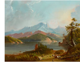
Title: Indians at the Mountain Lake Date: after 1853 Primary Maker: Alfred Jacob Miller Medium: oil on canvas