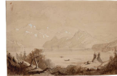
Title: Indian Encampment, Wind River Mountains Date: 1837 Primary Maker: Alfred Jacob Miller Medium: pencil and gouache on paper