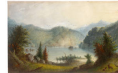
Title: Lake in Wind River Mountains Date: after 1837 Primary Maker: Alfred Jacob Miller Medium: watercolor, pen and ink on paper