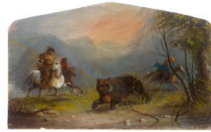
Title: Hunting the Grizzly Bear Date: c. 1858 Primary Maker: Alfred Jacob Miller Medium: oil on paper