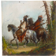
Title: Shoshone Indian Hunters Date: 1837 Primary Maker: Alfred Jacob Miller Medium: watercolor with pen and ink on paper