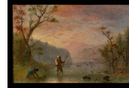
Title: Setting Traps for Beaver Date: after 1837 Primary Maker: Alfred Jacob Miller Medium: oil on academy board mounted to wood panel