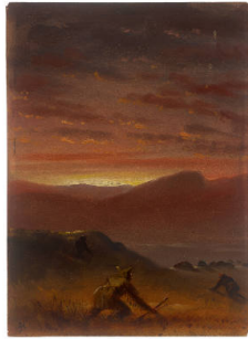
Title: Indians Stalking Buffalo Date: 1837 Primary Maker: Alfred Jacob Miller Medium: oil on paper