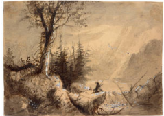
Title: Lake in Oregon Date: 1837 Primary Maker: Alfred Jacob Miller Medium: sepia wash with Chinese white on paper