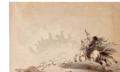
Title: Clouds of Dust Date: 1837 Primary Maker: Alfred Jacob Miller Medium: pen and ink, ink wash, with pencil and gouache on paper