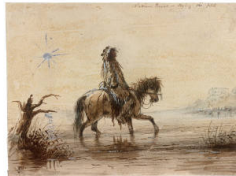
Title: Indian Guide, Trying the Ford Date: 1837 Primary Maker: Alfred Jacob Miller Medium: pen and ink, ink wash with white highlights on paper