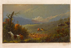
Title: Hunters Approaching Buffalo Date: after 1837 Primary Maker: Alfred Jacob Miller Medium: oil on paper mounted on paperboard