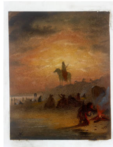
Title: Trappers at the Evening Meal Date: 1837 Primary Maker: Alfred Jacob Miller Medium: oil on paper mounted on paperboard