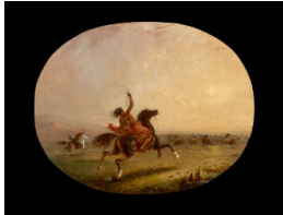
Title: Lassoing Wild Horses Date: after 1837 Primary Maker: Alfred Jacob Miller Medium: oil on canvas