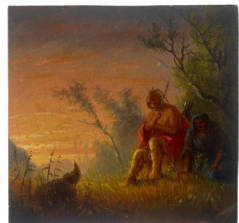
Title: Mourning at Skull-Marked Grave Date: after 1837 Primary Maker: Alfred Jacob Miller Medium: oil on paper