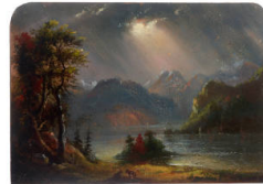
Title: Storm on Wind River Lake, Rocky Mountains Date: 1837 Primary Maker: Alfred Jacob Miller Medium: oil on paper