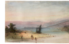
Title: Enroute, Rocky Mountains Date: 1837 Primary Maker: Alfred Jacob Miller Medium: watercolor on paper