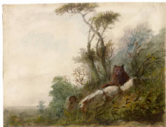
Title: Haunt of the Grizzly Bear Date: after 1837 Primary Maker: Alfred Jacob Miller Medium: watercolor on paper