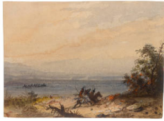
Title: Shoshones Escaping from Hostile Indians Date: 1837 Primary Maker: Alfred Jacob Miller Medium: watercolor on paper