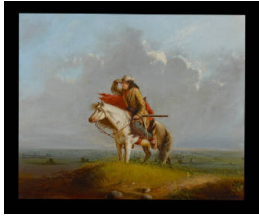
Title: Lost on the Prairie Date: c. 1855 Primary Maker: Alfred Jacob Miller Medium: oil on canvas