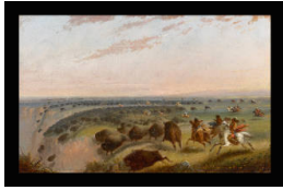
Title: Buffalo Hunting Date: after 1837 Primary Maker: Alfred Jacob Miller Medium: oil on canvas