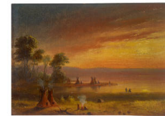
Title: Indian Encampment at Sunset Date: 1837 Primary Maker: Alfred Jacob Miller Medium: oil on paper