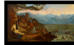
Title: Pipe of Peace at the Rendezvous Date: c. 1839 Primary Maker: Alfred Jacob Miller Medium: oil on canvas