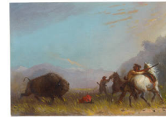
Title: Buffalo Strikes Back Date: after 1837 Primary Maker: Alfred Jacob Miller Medium: oil on paperboard