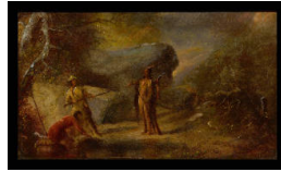
Title: Friend or Foe Date: after 1851 Primary Maker: Alfred Jacob Miller Medium: oil on paperboard