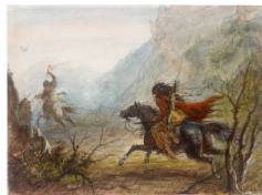
Title: Snake Indian Pursuing a Crow Horse Thief Date: after 1837 Primary Maker: Alfred Jacob Miller Medium: watercolor with pencil on paper