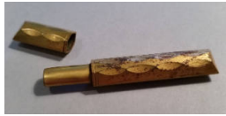
Title: Needle Case Date: c. 1900 Medium: metal