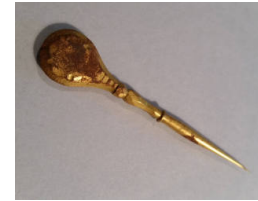
Title: Seam Ripper Date: c. 1900 Medium: metal