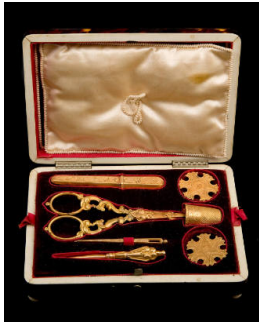
Title: Sewing Set Case Medium: shell and metal with velvet and silk