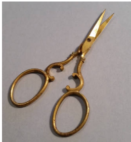
Title: Embroidery Scissors Date: c. 1900 Medium: metal