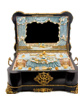
Title: Sewing Box Date: c. 1900 Primary Maker: Unknown French Medium: wood, porcelain, glass, and metal with silk and velvet