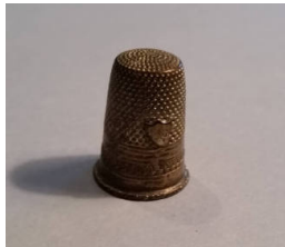
Title: Thimble Date: c. 1900 Medium: metal