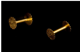
Title: Spindle Spool Date: c. 1900 Medium: metal