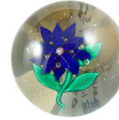
Title: Paperweight Date: c. 1870 Primary Maker: Boston & Sandwich Glass Company Medium: glass