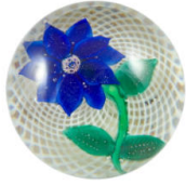
Title: Paperweight Date: c. 1870 Primary Maker: Boston & Sandwich Glass Company Medium: glass