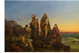
Title: The Last of Their Race Date: 1857 Primary Maker: John Mix Stanley Medium: oil on canvas