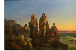
Title: The Last of Their Race Date: 1857 Primary Maker: John Mix Stanley Medium: oil on canvas