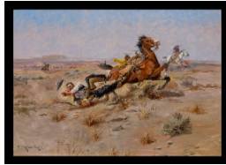
Title: Incident near Square Butte Date: 1897 Primary Maker: Charles Marion Russell Medium: oil on canvas