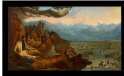
Title: Pipe of Peace at the Rendezvous Date: c. 1839 Primary Maker: Alfred Jacob Miller Medium: oil on canvas