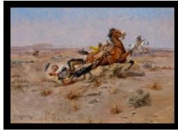
Title: Incident near Square Butte Date: 1897 Primary Maker: Charles Marion Russell Medium: oil on canvas