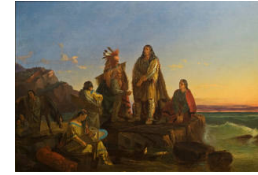
Title: The Last of Their Race Date: 1857 Primary Maker: John Mix Stanley Medium: oil on canvas