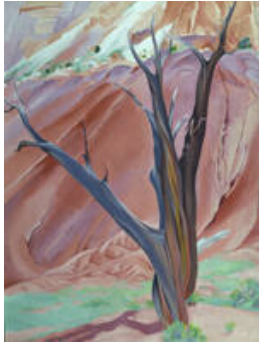
Title: Gerald's Tree II Date: 1937 Primary Maker: Georgia O'Keeffe Medium: oil on canvas