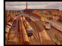
Title: The Chief Goes Through Date: 1956 Primary Maker: Ernest Leonard Blumenschein Medium: oil on canvas