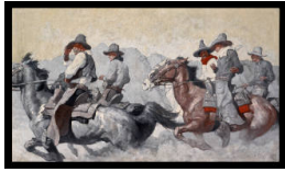
Title: I've Seen Him Ride Broncs That Had Piled the Best of Them, and as for Roping -- Even the Mexican Vaqueros Have Had to Hand It to Him More Than Once Date: 1925 Primary Maker: N. C. Wyeth Medium: oil on canvas