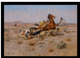
Title: Incident near Square Butte Date: 1897 Primary Maker: Charles Marion Russell Medium: oil on canvas