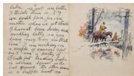
Title: Friend Goodwin [Philip R. Goodwin] Date: May 26, 1908 Primary Maker: Charles Marion Russell Medium: pen and ink, and watercolor on paper