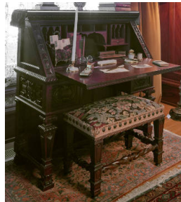
Title: Fall-Front Desk Date: c. 1900 Primary Maker: Unknown American Medium: mahogany