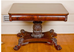
Title: Pedestal Table Date: c. 1920 Primary Maker: Robert Mitchell Furniture Company Medium: mahogany