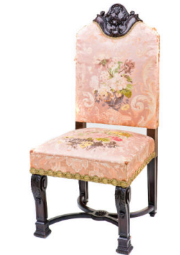
Title: Dining Room Side Chair Date: c.1900 Medium: mahogany with metal and silk with burlap, linen and horse hair