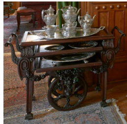
Title: Tea Cart Date: c. 1900 Primary Maker: Unknown American Medium: mahogany with metal