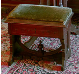
Title: Footstool Date: c. 1850 Primary Maker: Unknown American Medium: walnut with velvet and brass