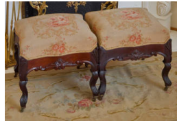
Title: Stool Date: c. 1900 Primary Maker: Unknown American Medium: mahogany with cloth and brass