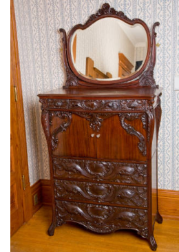
Title: Chiffonier Date: c. 1920 Primary Maker: Robert Mitchell Furniture Company Medium: mahogany with glass and metal