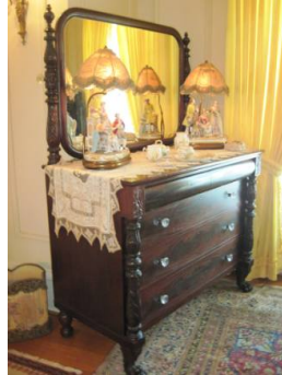
Title: Dresser Date: c. 1920 Primary Maker: Robert Mitchell Furniture Company Medium: mahogany with metal and glass