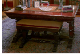
Title: Trestle Table Date: c. 1900 Primary Maker: Unknown American Medium: mahogany