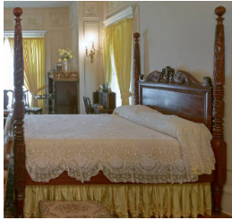
Title: Four Poster Bed Date: c. 1920 Primary Maker: Robert Mitchell Furniture Company Medium: mahogany with pine and metal