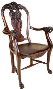
Title: Armchair Date: c.1900 Primary Maker: Robert Mitchell Furniture Company Medium: mahogany with cloth