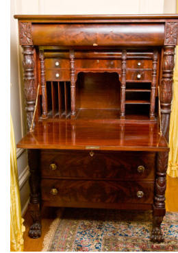
Title: Fall-Front Desk Date: c. 1920 Primary Maker: Robert Mitchell Furniture Company Medium: mahogany with glass and metal