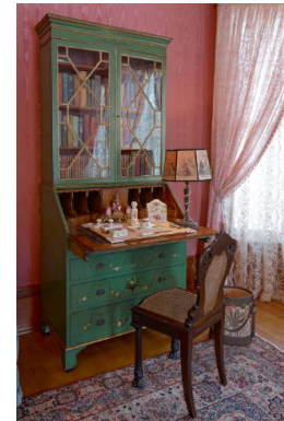
Title: Secretary Desk Date: c. 1840 Primary Maker: Unknown English Medium: mahogany, pine, and oak with glass, metal, and leather