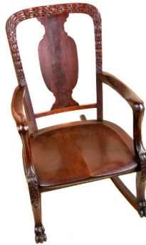
Title: Rocking Chair Date: c. 1920 Primary Maker: Robert Mitchell Furniture Company Medium: mahogany