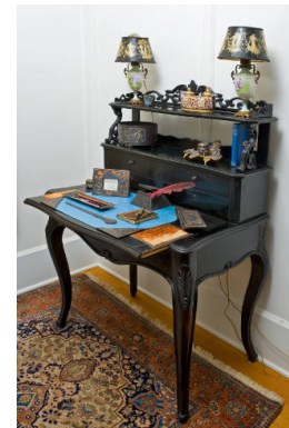
Title: Desk Date: c. 1900 Medium: mahogany with brass