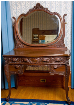
Title: Dressing Table Date: c. 1920 Primary Maker: Robert Mitchell Furniture Company Medium: mahogany with glass and metal