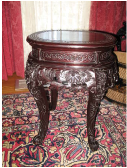
Title: Stool Date: c.1900 Primary Maker: Unknown Chinese Medium: mahogany