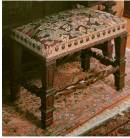
Title: Bench Date: c. 1900 Primary Maker: Unknown American Medium: mahogany with cloth and brass