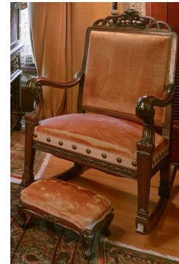
Title: Rocking Chair Date: c. 1900 Primary Maker: Unknown American Medium: mahogany with cloth and brass