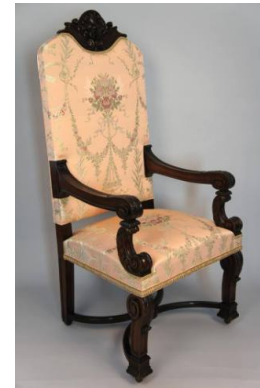
Title: Dining Room Armchair Date: c. 1900 Medium: mahogany with metal and silk with burlap, linen and horse hair