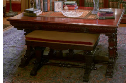
Title: Trestle Table Date: c. 1900 Primary Maker: Unknown American Medium: mahogany