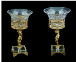
Title: Compote Date: c. 1900 Primary Maker: Unknown French Medium: bronze; glass