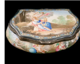
Title: Box Primary Maker: Unknown French Medium: metal; enamel