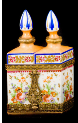
Title: Perfume Bottle Holder Primary Maker: Unknown French Medium: metal