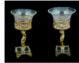
Title: Compote Date: c. 1900 Primary Maker: Unknown French Medium: bronze; glass