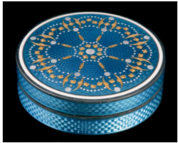
Title: Powder Box Primary Maker: Unknown French Medium: metal; blue enamel