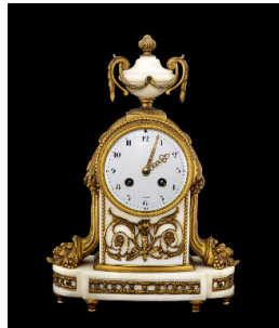
Title: Mantle Clock Primary Maker: Unknown French Medium: alabaster and bronze doré with glass and porcelain