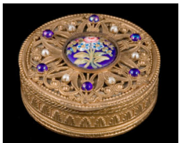
Title: Trinket Box Primary Maker: Unknown French Medium: metal; enamel; pearl; stone