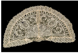
Title: Hair Piece Primary Maker: Unknown French Medium: lace