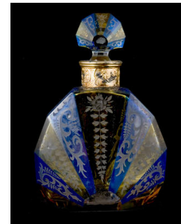
Title: Perfume Bottle Primary Maker: Unknown French Medium: glass; metal