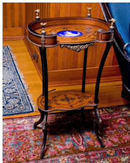
Title: End Table Date: c. 1900 Primary Maker: Unknown French Medium: wood and ebony with brass and porcelain