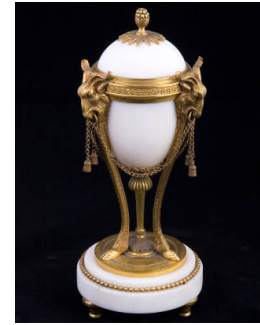
Title: Candlestick Lid Primary Maker: Unknown French Medium: alabaster and bronze doré