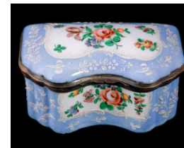
Title: Enameled Box Primary Maker: Unknown French Medium: porcelain; enamel; metal