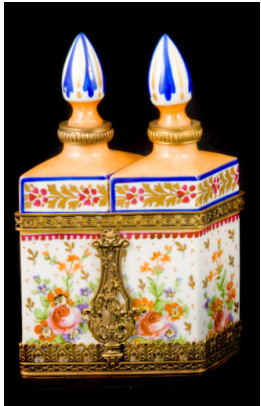
Title: Perfume Bottle Primary Maker: Unknown French Medium: porcelain