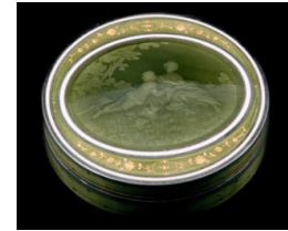
Title: Trinket Box Primary Maker: Unknown French Medium: gold (14K); enamel