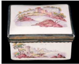
Title: Box Primary Maker: Unknown French Medium: metal; enamel