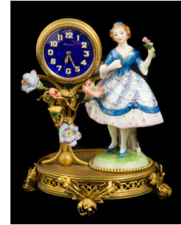
Title: Miniature Clock Primary Maker: Unknown French Medium: metal; enamel; glass