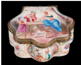
Title: Box Primary Maker: Unknown French Medium: metal; enameled