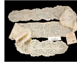
Title: Lappet Date: 1700-1799 Primary Maker: Unknown French Medium: lace