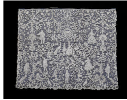
Title: Jabot Date: 18th Century Primary Maker: Unknown French Medium: lace; fabric