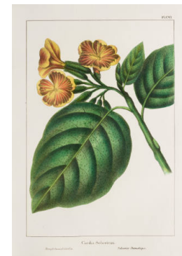
Title: Cordia Sebestena Date: 1871 Primary Maker: Thomas Nuttall Medium: lithograph on paper, hand-colored