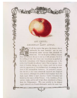
Title: Api Petit; or American Lady Apple Primary Maker: Benjamin Maund Medium: engraving on paper, hand-colored