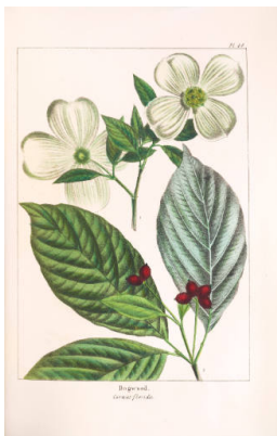
Title: Dogwood Date: 1871 Primary Maker: François André Michaux Medium: engraving