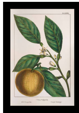
Title: Wild Orange Tree Date: 1871 Primary Maker: Thomas Nuttall Medium: lithograph on paper, hand-colored