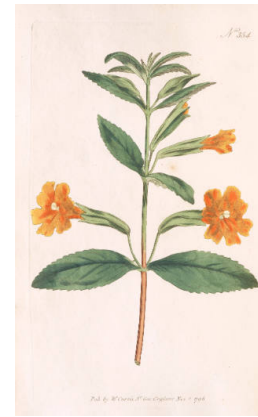
Title: Mimulus Aurantiacus. Orange Monkey-Flower. Date: 1796-97 Primary Maker: William Curtis Medium: Engraving