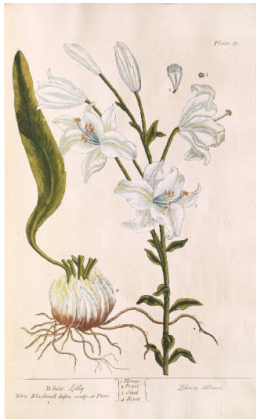
Title: White Lilly. Lilium album. Date: 1737 Primary Maker: Elizabeth Blackwell Medium: copper plate engraving on paper; hand-colored