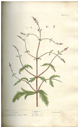
Title: Vervein. Verbena and Verbenaca. Date: 1737 Primary Maker: Elizabeth Blackwell Medium: copper plate engraving on paper; hand-colored