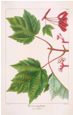
Title: Red-Flowering Maple Date: 1871 Primary Maker: François André Michaux Medium: Engraving