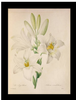
Title: Lilium candidum Date: 1827 Primary Maker: Pierre Joseph Redouté Medium: stipple engraving in color on paper, hand-colored