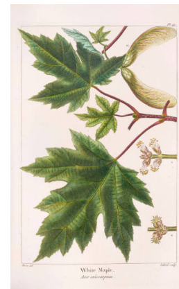
Title: White Maple Date: 1871 Primary Maker: François André Michaux Medium: Engraving