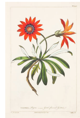
Title: Gorteria Rigens Date: 1809 Primary Maker: Philip Miller Medium: engraving on paper, hand-colored