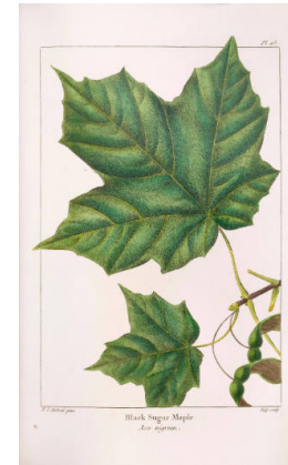
Title: Black Sugar Maple Date: 1871 Primary Maker: François André Michaux Medium: engraving