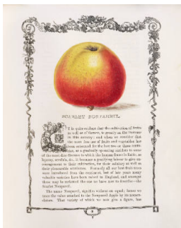
Title: Scarlet Nonpareil Primary Maker: Benjamin Maund Medium: engraving on paper, hand-colored