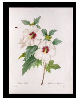
Title: Hibiscus Syriacus Date: 1827 Primary Maker: Pierre Joseph Redouté Medium: stipple engraving in color on paper, hand-colored