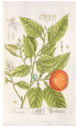
Title: Aurantia Date: 1760 Primary Maker: Elizabeth Blackwell Medium: Engraving