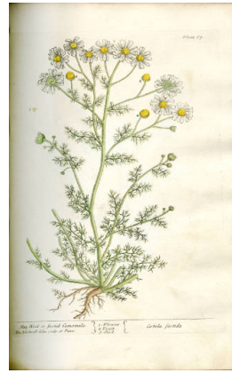
Title: May-Weed, or Faetid Camomile. Cotula faetida. Date: 1737 Primary Maker: Elizabeth Blackwell Medium: copper plate engraving on paper; hand-colored