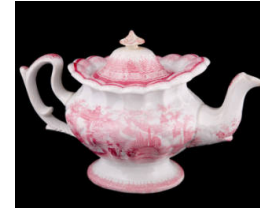
Title: Teapot Primary Maker: W. Wood & Company Medium: earthenware with transfer print