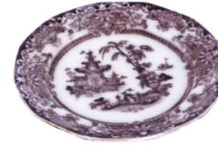
Title: Plate Date: 1834-1859 Primary Maker: Podmore, Walker & Company Medium: ironstone with black transfer print