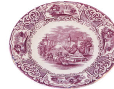
Title: Plate Primary Maker: J. & G. Meakin Medium: ironstone with purple transfer print