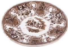
Title: Texian Campaign Plate Primary Maker: James Beech Medium: earthenware with brown transfer print