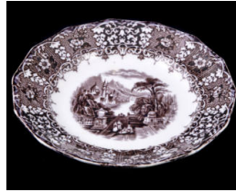
Title: Plate Primary Maker: Holdcroft & Company Medium: ironstone with black transfer print