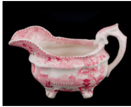
Title: Sauceboat Primary Maker: Staffordshire Medium: earthenware with transfer print