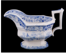
Title: Sauceboat Primary Maker: Staffordshire Medium: earthenware with transfer print