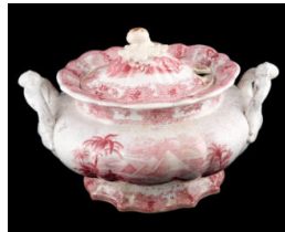
Title: Tureen Lid Date: 1829-1845 Primary Maker: Charles James Mason & Company Medium: earthenware with transfer print