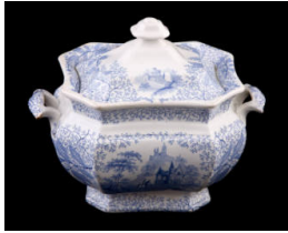
Title: Tureen Primary Maker: Staffordshire Medium: earthenware with transfer print