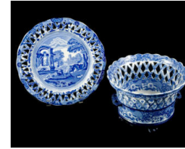
Title: Underplate Primary Maker: Staffordshire Medium: earthenware with blue transfer print