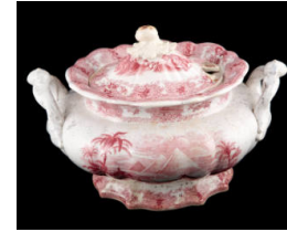
Title: Tureen Date: 1829-1845 Primary Maker: Charles James Mason & Company Medium: earthenware with transfer print