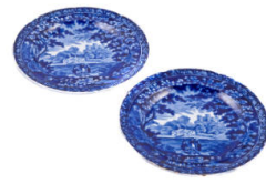
Title: Plate Primary Maker: Ralph & James Clews Medium: earthenware with blue transfer print