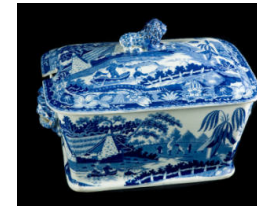
Title: Tureen Lid Primary Maker: Staffordshire Medium: earthenware with blue transfer print