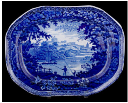
Title: Platter Date: c. 1844 Primary Maker: Ralph & James Clews Medium: ironstone with blue transfer print