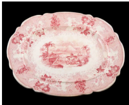
Title: Platter Date: 1829 - 1845 Primary Maker: Mason's Ironstone China Medium: earthenware with pink transfer print