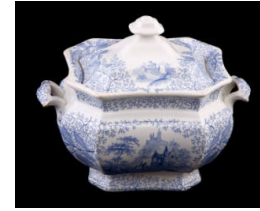
Title: Tureen Lid Primary Maker: Staffordshire Medium: earthenware with transfer print