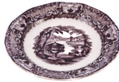
Title: Plate Date: c. 1840 Primary Maker: Podmore, Walker & Company Medium: pearlstone with black transfer print