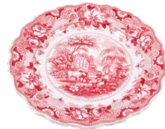
Title: Plate Date: c. 1822 - 1841 Primary Maker: Staffordshire Medium: earthenware with red transfer print