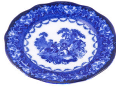
Title: Plate Date: 1878 - 1894 Primary Maker: Staffordshire Medium: ironstone; flow blue transfer print