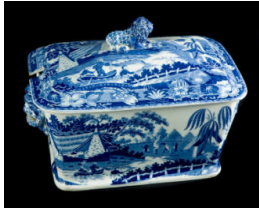
Title: Tureen Primary Maker: Staffordshire Medium: earthenware with blue transfer print