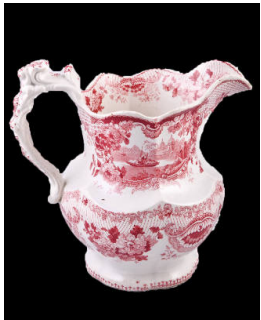
Title: Pitcher Date: c. 1850 Primary Maker: Staffordshire Medium: earthenware with transfer print