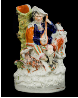
Title: Spill Holder Primary Maker: Staffordshire Medium: earthenware