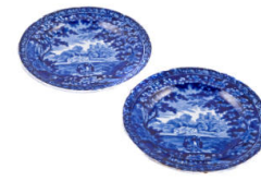
Title: Plate Primary Maker: Ralph & James Clews Medium: earthenware with blue transfer print